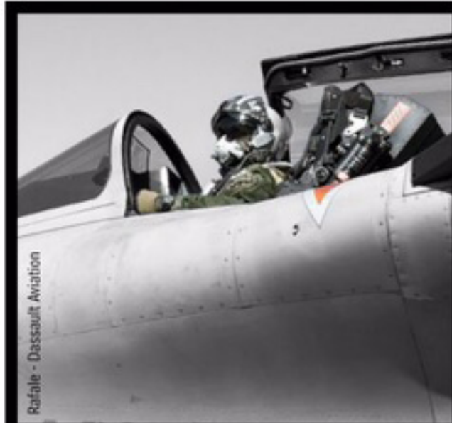
Rafale - Dassault Aviation

Technology companies shine this year in terms of revenue growth while those in property continue to feature prominently. With a tandem rise in profits, shareholders can expect to reap good dividends and a rise in share price. 10-12