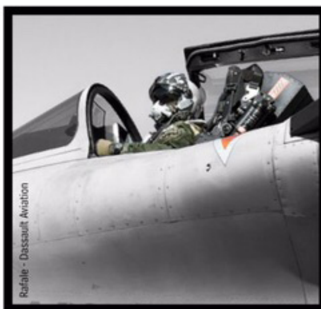
Rafale - Dassault Aviation

Technology companies shine this year in terms of revenue growth while those in property continue to feature prominently. With a tandem rise in profits, shareholders can expect to reap good dividends and a rise in share price. 10-12