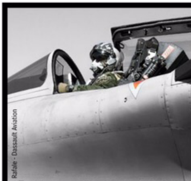
Rafale - Dassault Aviation

Technology companies shine this year in terms of revenue growth while those in property continue to feature prominently. With a tandem rise in profits, shareholders can expect to reap good dividends and a rise in share price. 10-12